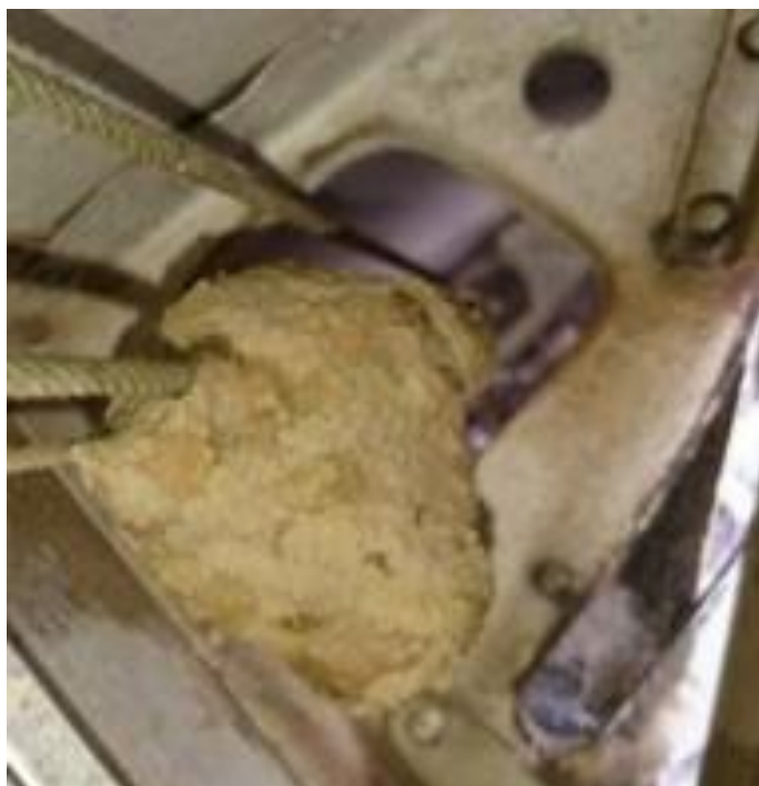
CASA – AWB-02-052

It is important that prior to every flight you complete a thorough inspection of your aircraft and then after parking to install appropriate covers such as those for the pitot tube.